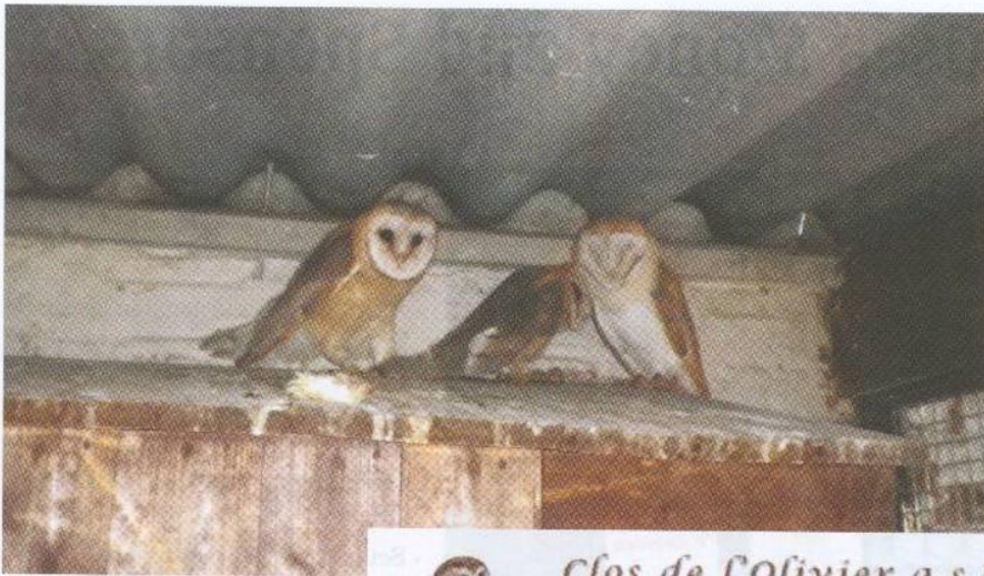
△Recuperating barn owls.

sick, injured or weak animal though, this is the place to bring them.