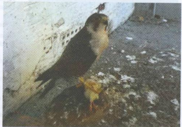
△Peregrine Falcon rescued from SHAPE.

103-0205108-21. Food, cages, aviaries, medical materials, building materials and other accessories are also welcome. You can even sponsor an animal or spend your money in the online shop. Whether you choose to donate or not, if you find an animal in distress, you are contributing to the survival of the wildlife on your local patch if you bring it to this special haven – le Clos de l'Olivier.