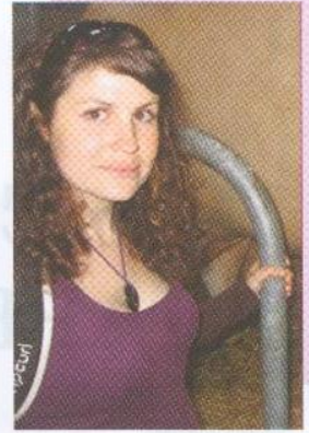
◁Clos de l'Olivier main building.

exhausted or abandoned with the aim of ultimately releasing them back to nature. Since the centre opened in 1998, more than 5000 animals have come through its