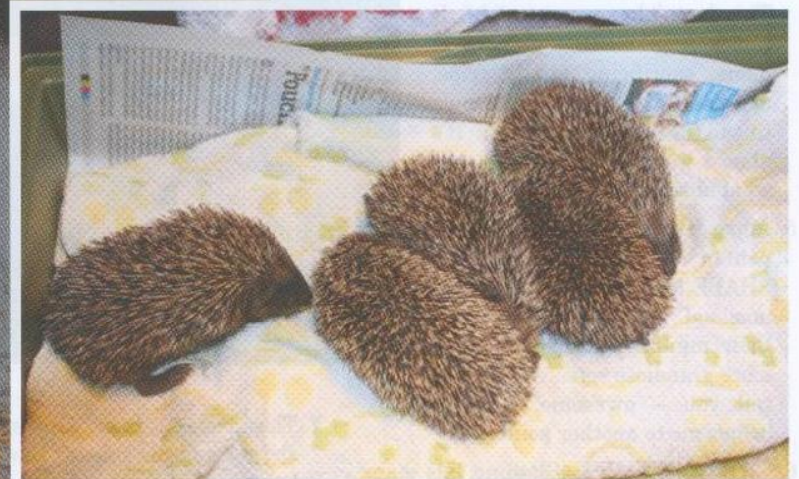
△Young abandoned hedgehogs.