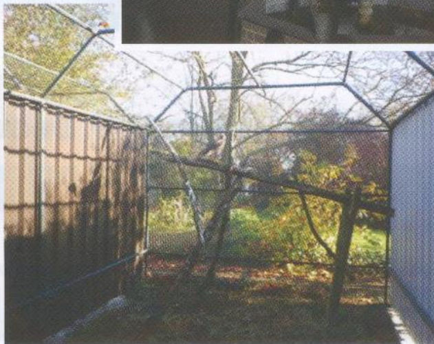
△Buzzard in an aviary practising flight.

the public to prevent unnecessary disturbance to the residents. If you do happen to come across a